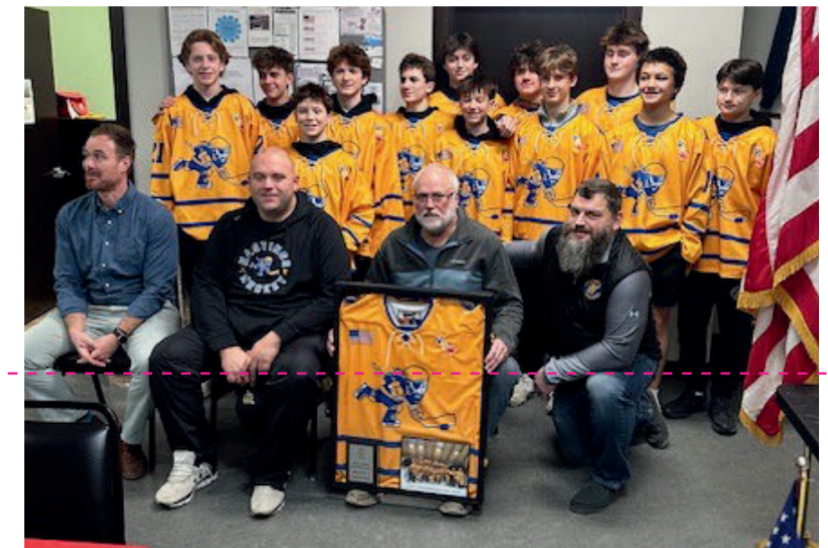
The Hastings A Bantam Hockey Team Participated in the VFW State Tournament. They finished 2 nd out of 12 teams invited and stopped by the Post to show their appreciation to Post 1210.