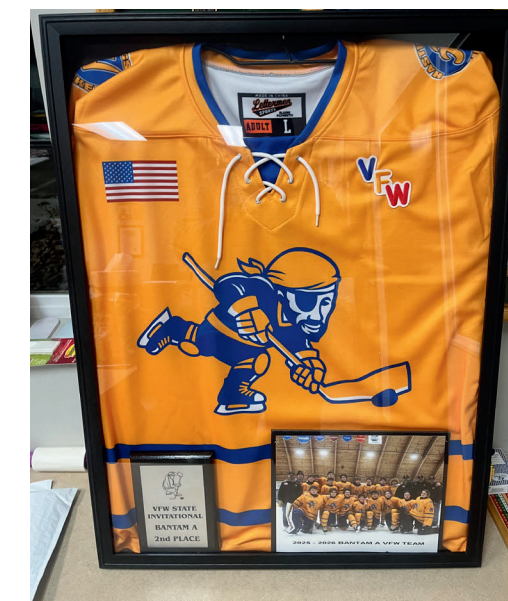
This framed Jersey is on display at the Post with a team picture and their 2 nd Place Plaque. A First-Class group of kids and Coaches!